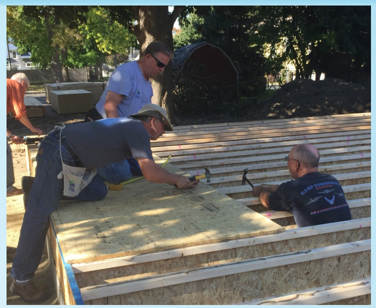
The Habitat experience reaches far beyond the stability it creates for homeowners. The volunteer force building and repairing homes brings community members together for a common goal; neighborhoods see an increase in stability with homeownership; and communities benefit from the increase in the tax base.